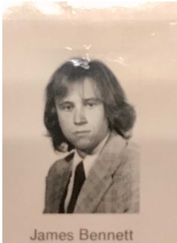
University of Minnesota Veterinary Class of 1981 class photo

CHECK US OUT ON FACEBOOK AND DAIRYMED.COM !